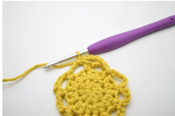
16. Like this.