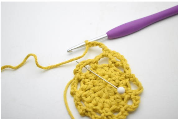
17. "Ch 4, work 1 sc into the next ch space"