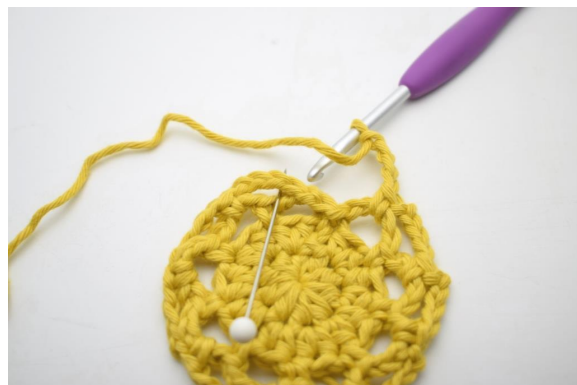
20. To end the round, work 1 sc into the first ch space made in this same round.