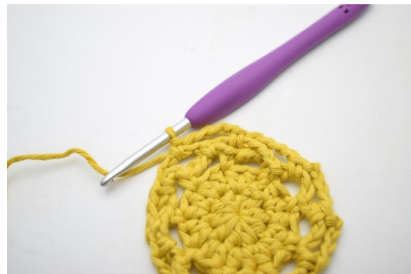
23. Like this.