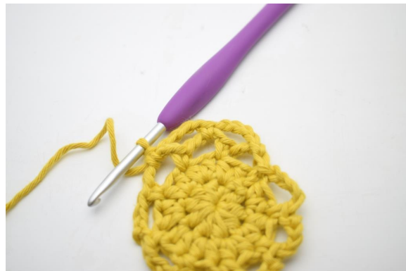
18. Like this.