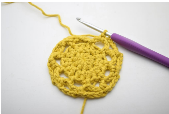
19. Repeat "to" to the end of the round.