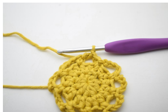
14. Like this.