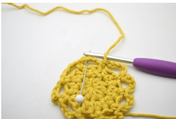
13. Work 2 sl sts up along the first ch space to begin in the middle of the space.