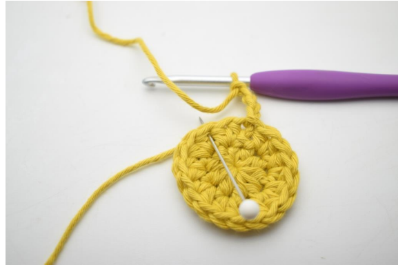
5. Skip 1 st and work 1 sc in the next st".