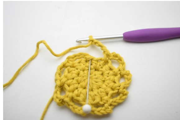
11. Finish with a sl st.