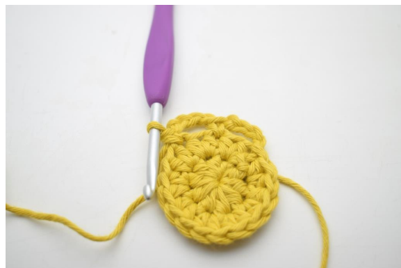
9. Like this.