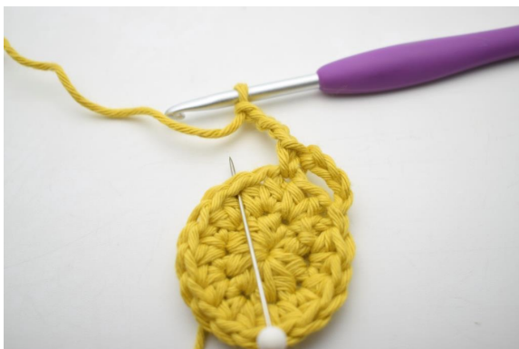
8. Skip 1 st and work 1 sc in the next st".