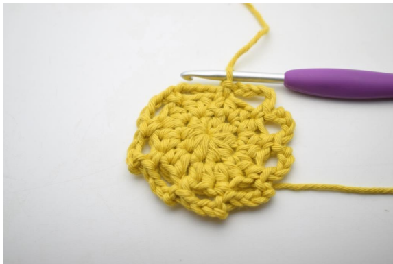
12. Like this. (9 ch spaces)