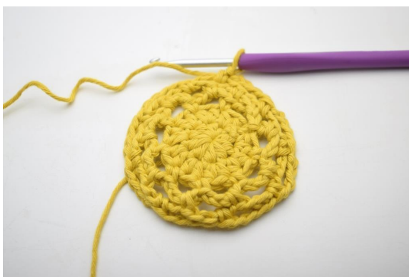
24. Repeat "to" to the end of the round. (9 ch spaces)