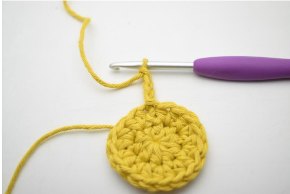
4. "Ch 4."