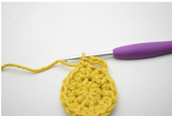
6. Like this.