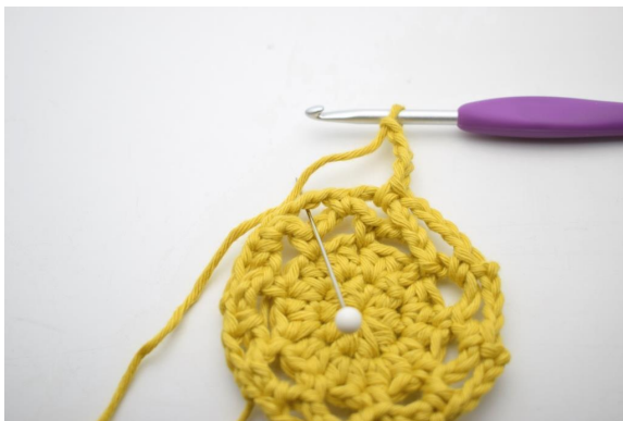
22. "Ch 4, work 1 sc into the next ch space"