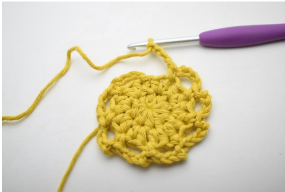
10. Repeat "to" to the end of the round.