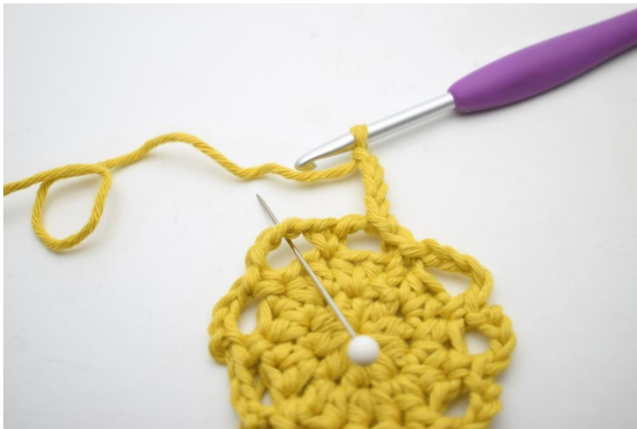
15. "Ch 4, work 1 sc into the next ch space"