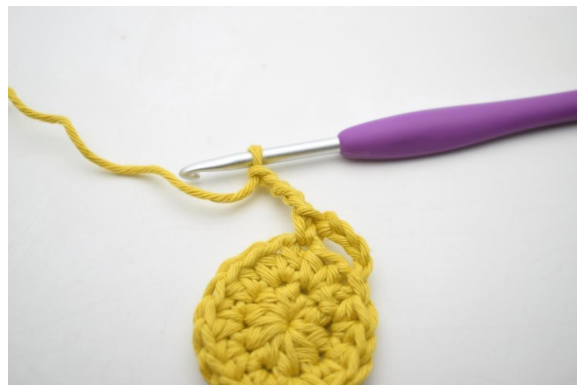
7. "Ch 4."