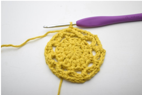
21. Like this. (9 ch spaces)